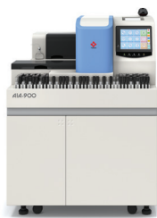
AIA-900 Loader Model 90 Tests Per Hour