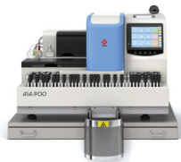
AIA-900 Benchtop 90 Tests Per Hour