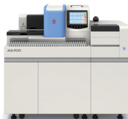
AIA-900 with 9 tray sorter 90 Tests Per Hour Also available with 19 Tray Sorter